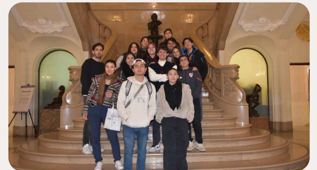
● GOVERNMENT VISIT