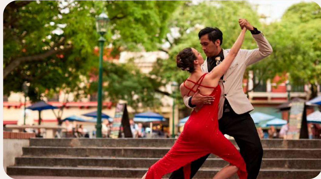
● THEATER AND TANGO