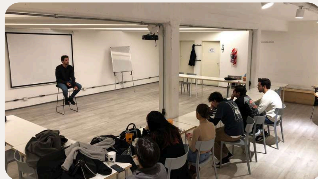
● ENTREPRENEURS MEETINGS