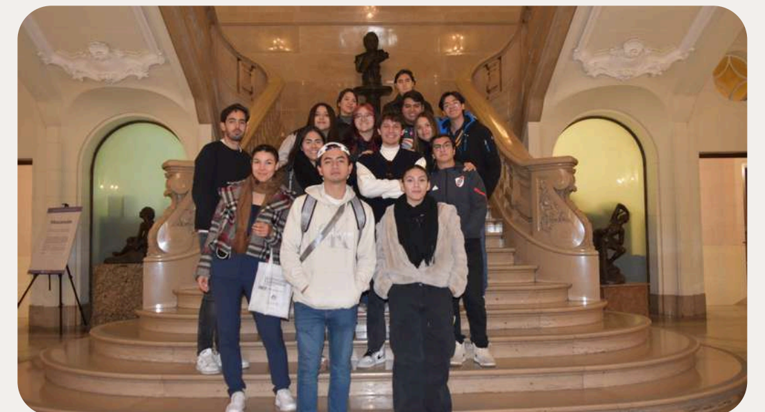
● GOVERNMENT VISIT